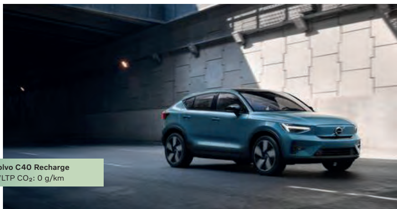
Volvo C40 Recharge WLTP CO 2 : 0 g/km