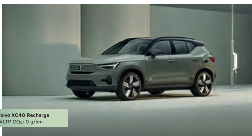
Volvo XC40 Recharge WLTP CO 2 : 0 g/km