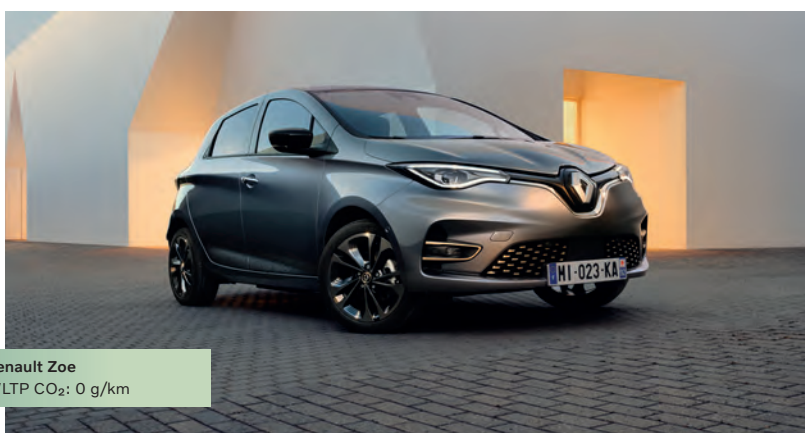
Renault Zoe WLTP CO 2 : 0 g/km