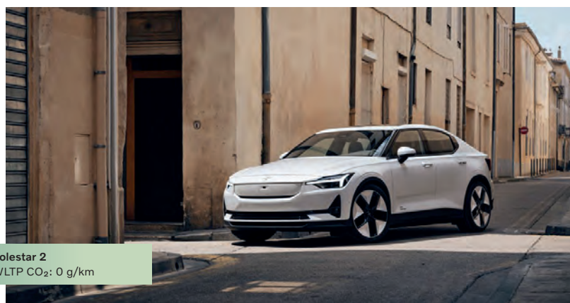
Polestar 2 WLTP CO 2 : 0 g/km